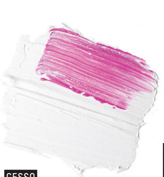
GESSO An opaque matte white ground. Apply to surfaces to seal and prepare before painting.

These mediums cover all the bases and are a good introduction before you enter the world of professional mediums. They let you prep your surfaces, adjust viscosity, flow and sheen. You can change paint opacity, drying time and texture, or protect your finished work.