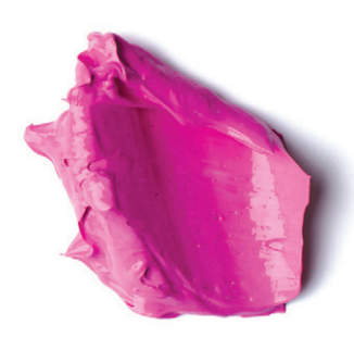
GLOSS HEAVY GEL As Gloss Gel Medium, but thicker. Ideal for impasto applications.