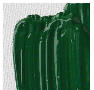
MASSTONE The color straight from the tube - rich and concentrated.

How long will it resist fading? Each pigment is rated on scale by the American Society for Testing & Materials (ASTM). Basics paints are all ASTM I (excellent) or II (very good) and considered permanent and lightfast* for 50-100+ years in gallery conditions.