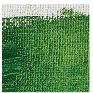
UNDERTONE The color applied thinly or diluted - generally more transparent.