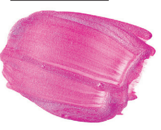
IRIDESCENT MEDIUM A reflective metallic medium. Mix with color or use on its own.