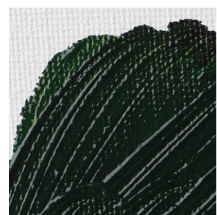
SHADE When a color is mixed with black.