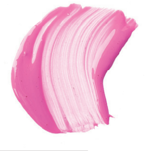
GLOSS FLUID MEDIUM A colorless acrylic medium. Mix with color to thin and add transparency or use on its own as a collage adhesive. Gives an archival gloss finish.