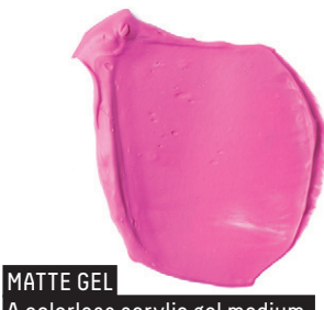
A colorless acrylic gel medium. Mix with color to thicken, add transparency and slow dry time. Gives an archival matte finish.